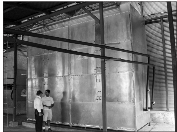
Figure 1: Industrial solar coffee dryers installed at the Montes de Oro Cooperative, Mirimar, Costa Rica.

Energy conservation will be further realized at Montes de Oro through the practise of co-generation, using waste products from coffee production to produce electricity through a thermo-chemical gasification process that is currently operational at Montes de Oro. This co-generation will be able to produce 15 kWh of electric power, more than sufficient to supply the 2 kWh required for the solar/biomass dryer. For gasification, coffee parchment is collected and gasified by a thermo-chemical reaction called pyrolysis, in which the carbohydrates of the parchment are broken down to their fundamental molecular components. A gaseous mixture of hydrogen, carbon monoxide and oxygen are the main components of the so-called producer gas, which is a fuel that burns similar to natural gas or propane, although with a lower energy content. With this